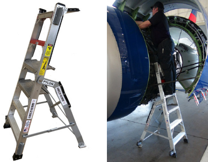
Nose gear, main landing gear, engine under the cowling