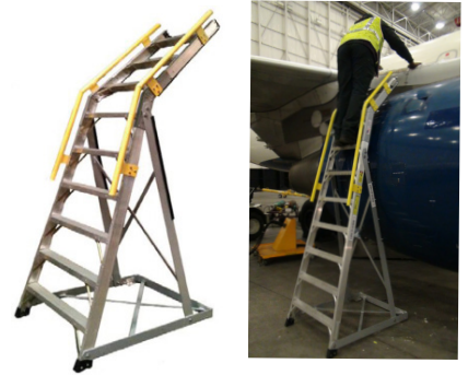
Upper engine and pylon panels.