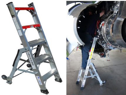
Thrust reverser under the cowling