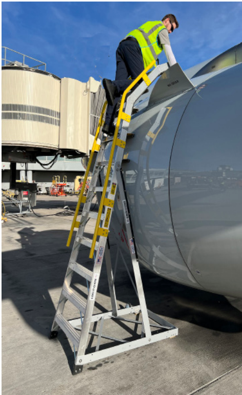
12COWLPYLON rolls easily on hard rubber wheels and slides in place on brass feet to allow safer working access to the service panels on top of the engine pylon area.