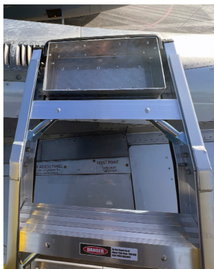
Built in TOOL TRAY at the top of the ladder facilitates quick repairs and maintenance tasks as tools and parts are staged next to the work area.

Made one at a time by skilled craftsmen in the U.S.A.