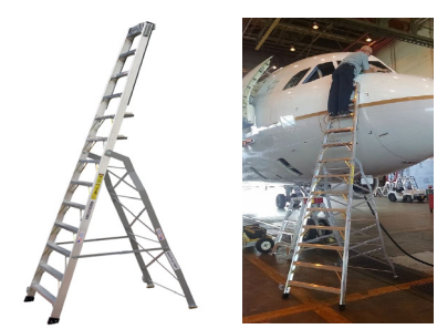
Front windscreen both sides.

Contact: Aircraft Sales LockNClimb, LLC 2500 West Laurel Street Independence, KS 67301 sales @locknclimb.com (620) 577-2577