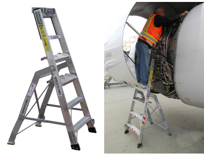
GPU port, lower fan cowl, and nost hrust reversers, GPU port, and landing gear side.