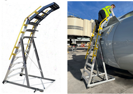
Outside fan cowling and top pylon area.