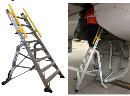
Cargo baggage bays also wheel well, landing gear.