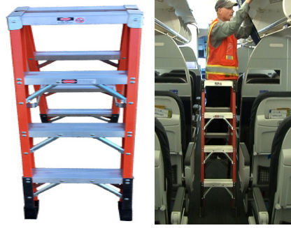
Interior overhead cabin bins, galley bins and electronics.