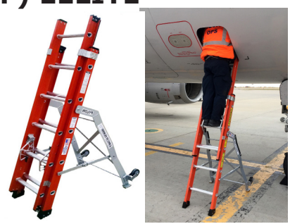
Fuselage belly and front access EE compartments.