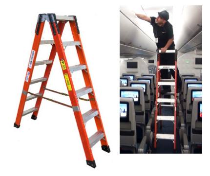
Interior overhead cabin bins, galley bins and electronics.