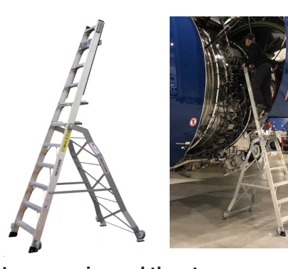
Lower engine and thrust reverser, higher nose gear area.