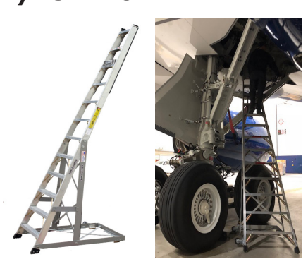
Landing gear and wheel well