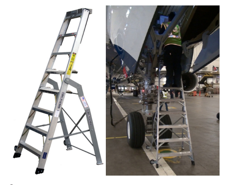
Lower nose gear area.