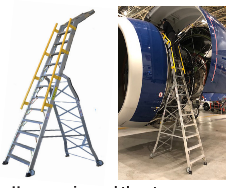
Upper engine and thrust reversers.

"Ladders designed by mechanics for use by mechanics."