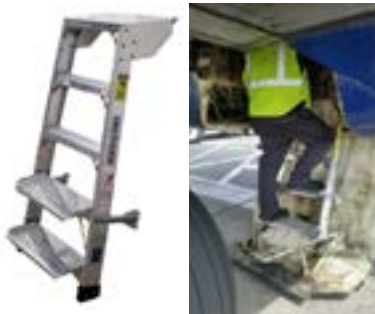
MD 88/90 wheel well.