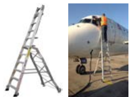
Open cowling hatch, front pylon, and windscreen.