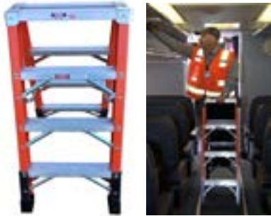
Interior overhead cabin bins, galley bins and electronics.