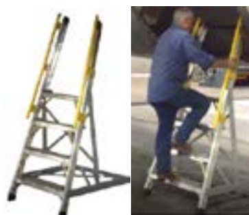
Step-through entry into fore and aft cargo bins.