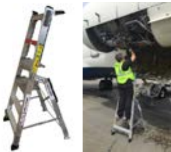
Engine and thrust reverser.