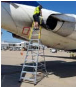
Service to aft pylon area.