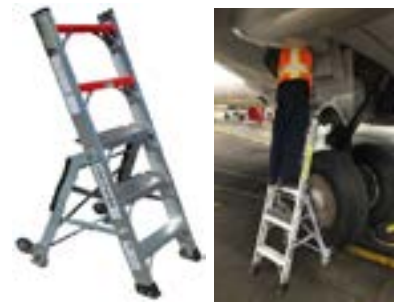
Landing gear of the B717.