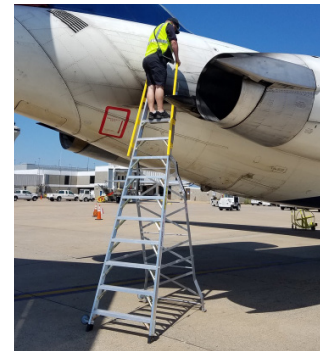
Service to aft pylon area.