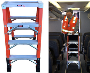
Interior overhead cabin bins, galley bins and electronics.