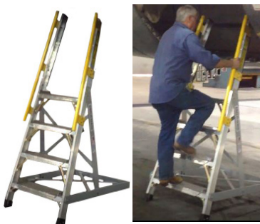
Step-through entry into fore and aft cargo bins.