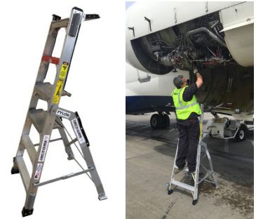
Engine and thrust reverser.