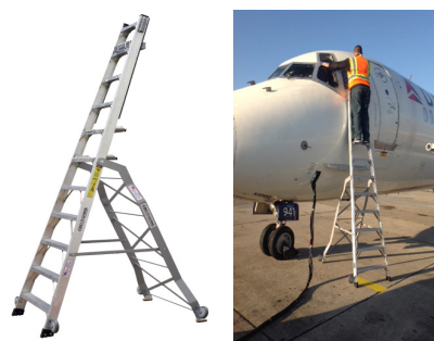
Open cowling hatch, front pylon, and windscreen.