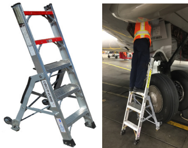
Landing gear and wheel well.