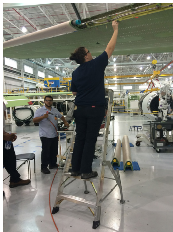
6LNCOPYLON lightweight handy ladder to perform service on the lower areas of the fuselage.