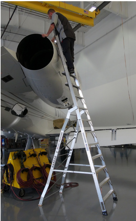
15LNCOPYLON provides stable reach for servicing the back pylon and fab cowl panels.