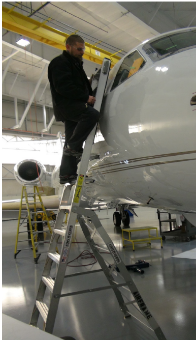
12LNCOPYLON allows easy stable access to windshield area.