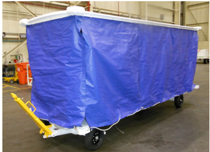
The LockN-Cart can be enclosed with protective tarps.

Clyde Machines 15F3500 5' x 10' airline baggage cart base with 8,000 lb. capacity. • Base topped with structural steel rack to hold LockNClimb ladders. • Ladders fit neatly in their allocated compartments or on the racks to prevent damage when not in use. • Rolls easily, 3-inch standard pintel hook allows for towing behind ramp and hanger service vehicles. • Small footprint allows for convenient storage. • Total weight 1200 lbs. • Recommended for use to hold LockN-Climb ergonomic ladder packages that have been specifically designed to service all types of commercial, corporate and private aircraft located at any MRO or FBO facility around the world.