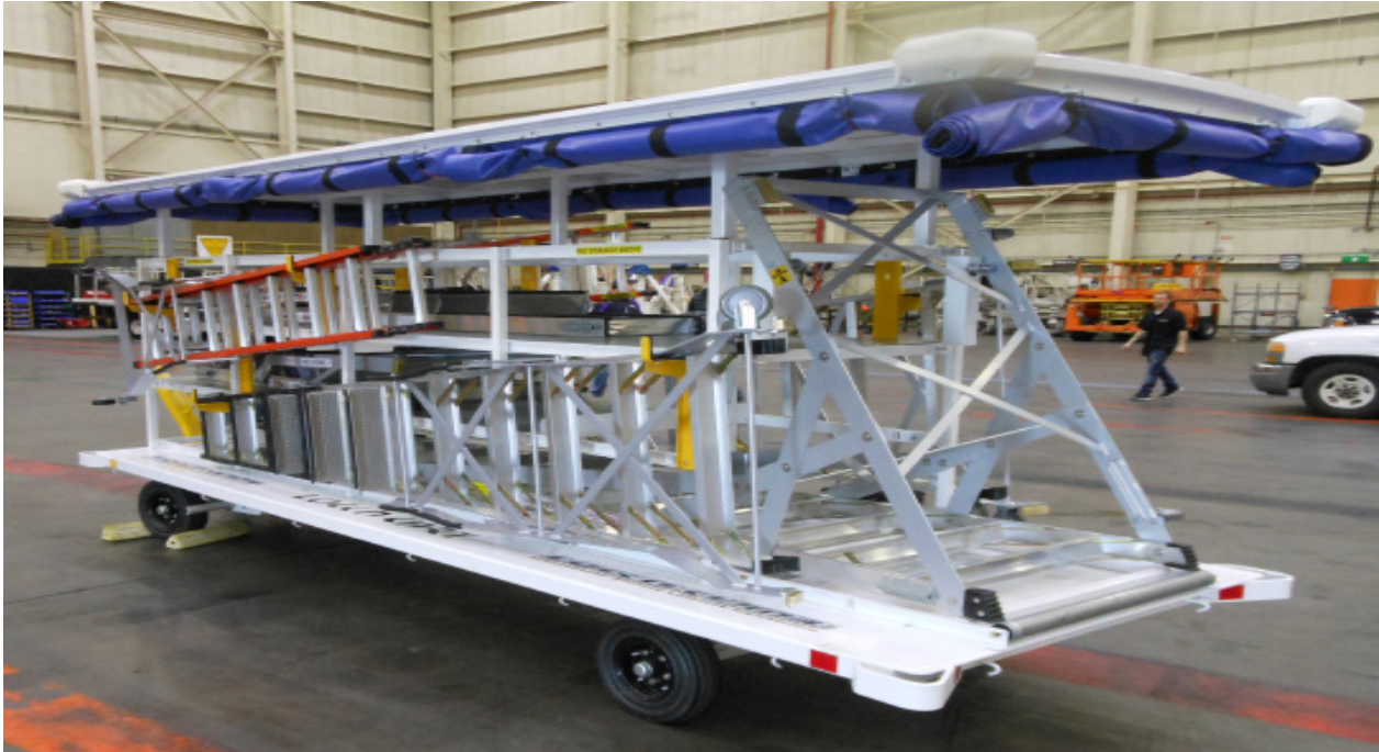
The LockN-Cart is designed to hold the complete ergonomic safety ladder system for each aircraft.