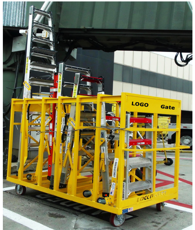
The LockNCart2 allows easy storage of line ladders corresponding to color-coded system.

The LockNCart2 line ladder organization system utilizes color coding so line technicians can keep ladders where they belong on the flight line.