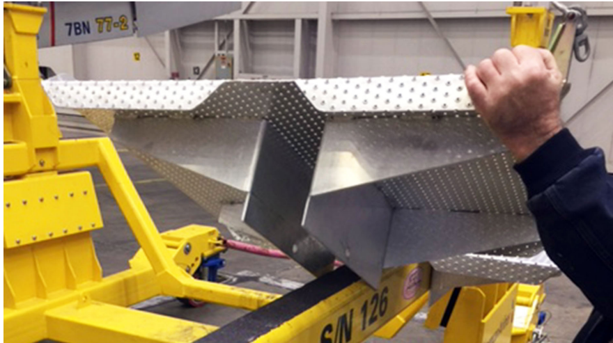
The LOCKN-WALK fits securely over the horizontal rail of the engine stand.